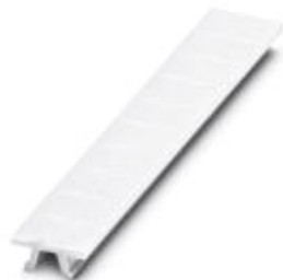
Zack marker strip, 10-section, horizontally labeled with the consecutive numbers: 21 ... 30, white, width: 6 mm

Please be informed that the data shown in this PDF Document is generated from our Online Catalog. Please find the complete data in the user's documentation. Our General Terms of Use for Downloads are valid ( http://phoenixcontact.com/download )